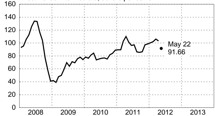
U.S. Spot Crude Petroleum Price West Texas Intermediate, dollars per barrel